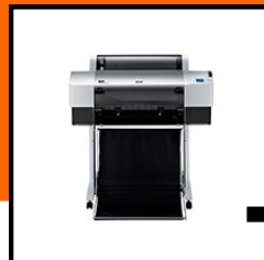
EPSON 7800 SUBLIMATION PRINTER