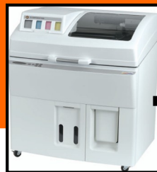
ZCORP 510 COLOR PRINTER