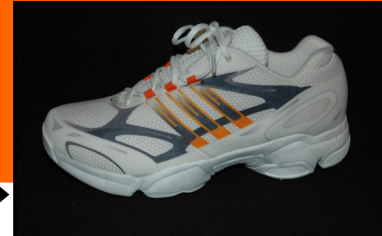
PRINTED UPPER STITCHED WITH LACES