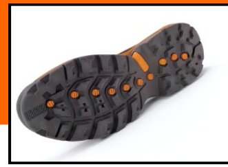
RAPID PROTOTYPE IN COLOR (ONE PIECE SHOWN)